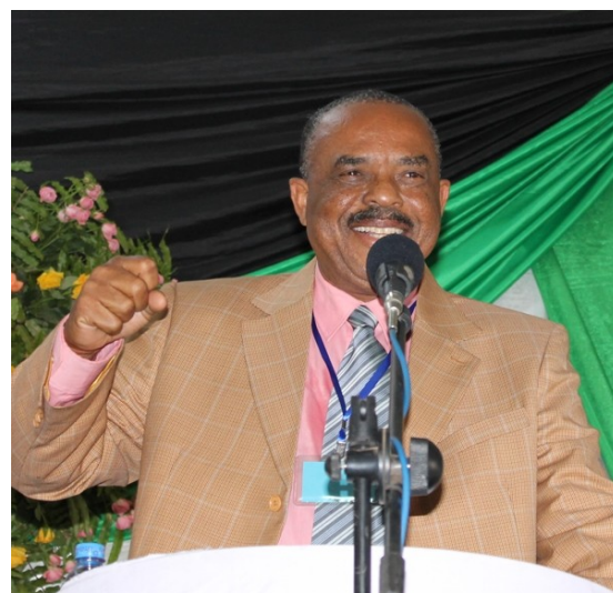
The Trade Union Congress of Tanzania (Tucta) secretary General