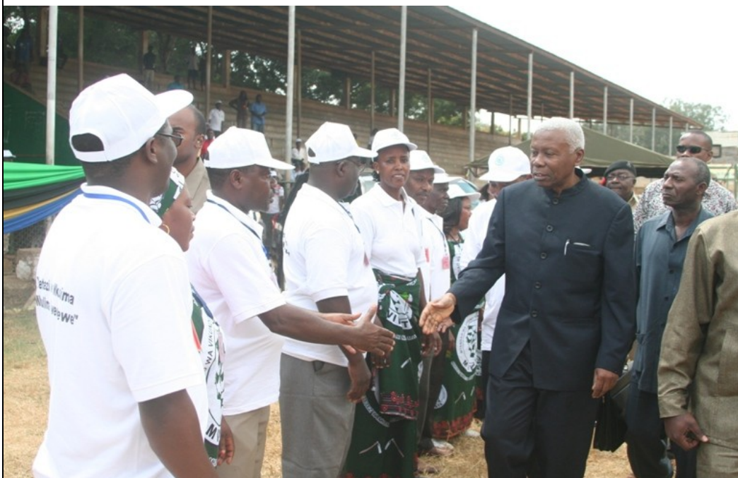
Board of directors and Senior officials of MVIWATA receiving the Vice President of the United Republic of Tanzania, Dr Garib Billal who was the guest of honour to the last day of MVIWATA's 20th Anniversary ceremony in Morogoro

It was a storm of both joy and jubilation seeing what started as a 22-small farmers' organisation bringing together hundreds of its devoted members from across the country to mark this special day that was well attended with