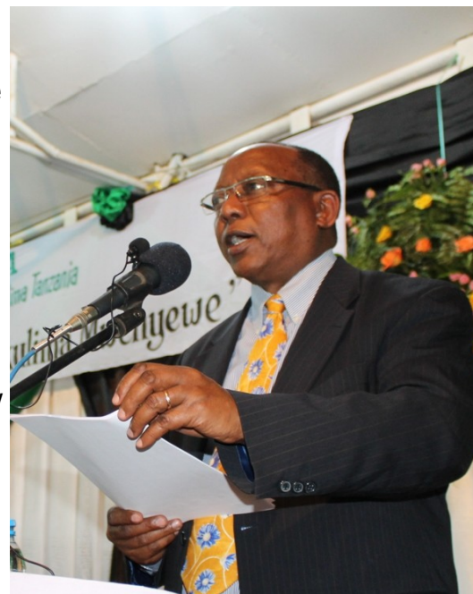
Former Prime Minister, Hon. Frederick Sumaye