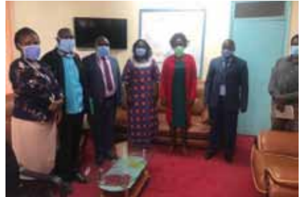
In Kenya – KESSFF worked in Pokot Counties advocating for increase funding to the agriculture sectors and improved extension services. By the end of June 2020, the subsector in West Pokot was allocated Ksh.278.23 million and Ksh.86.7 million for recurrent and developmentexpenditure respectively which translated as 6.2% of the total county public expenditure an increase of 1.5% from FY 2019/20.