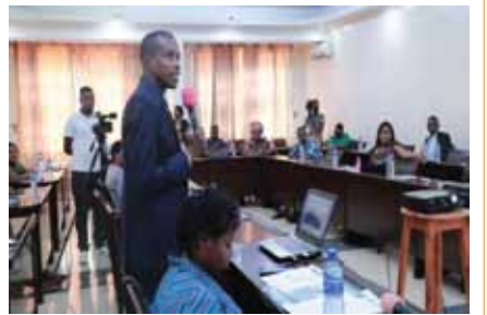
In Burundi – ESAFF Burundi small-scale farmers called on agriculture budget increase and set of agricultural bank and completion of stalled irrigation of Kajekein Bubanza District.