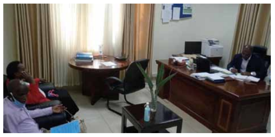
SSFs from APPEE-ESAFF Rwanda Meeting The Permanent Secretary Minagr-Rwandai, On 17-June 2020 For Submission Of Position Paper From Small Holder Farmers In Rwanda

In seven countries, small scale farmers identified more than 14 agriculture policy issues that were advocated at various levels and responded by central and district councils as follows;