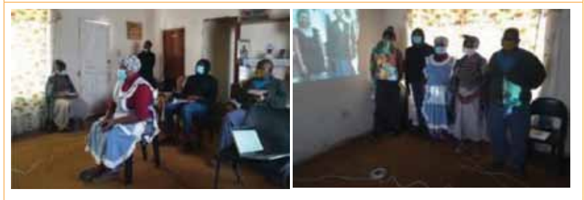
Farmers consultation meeting